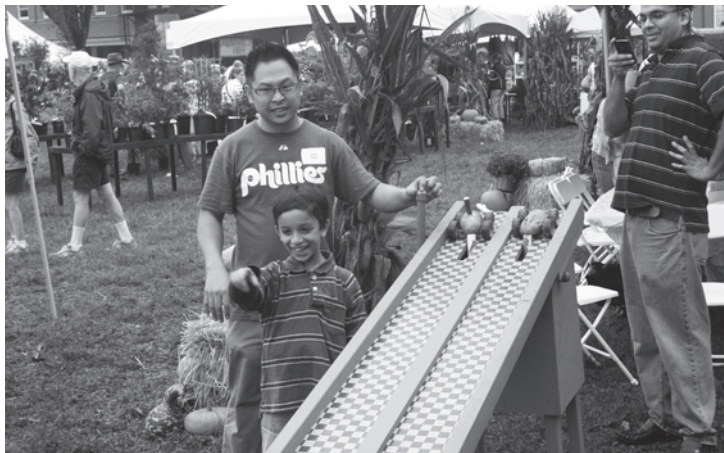
The 2012 PHS Fall Garden Festival will be held September 22.